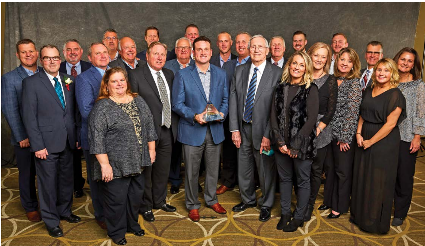
Shepherd Insurance staff receives the Agency of the Year award at the IIAI recognition banquet.