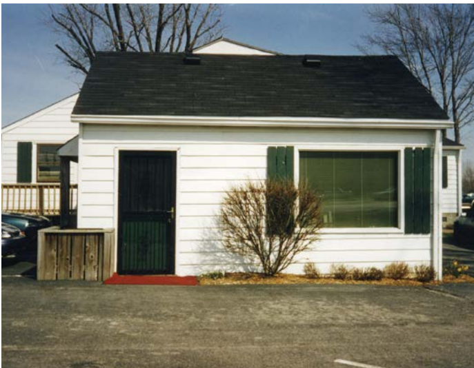
Shepherd Insurance's first office at 126th Street and Meridian.